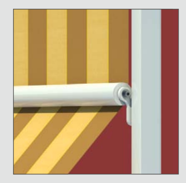
The deflector roll guides the awning fabric and maintains uniform fabric tension.