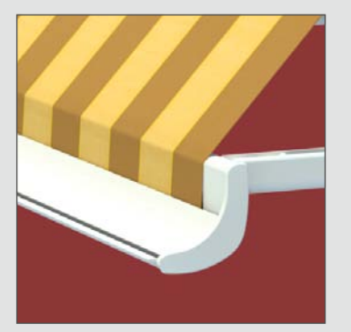
The elegant front profile closes the cassette when retracted.

High-quality pneumatic springs ensure that the awning fabric is perfectly tensioned in any extended position.